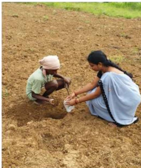
Fig. 2: Collection of soil sample at rice field during the pre-cropping period

The collected soil samples were dried under the sun light then grinded by using mortar and sieved through 2mm mesh size sieves to obtain fine sand particles. The physico-chemical parameters like Soil texture (Silt, Clay and Sand), pH, Organic Carbon(OC),